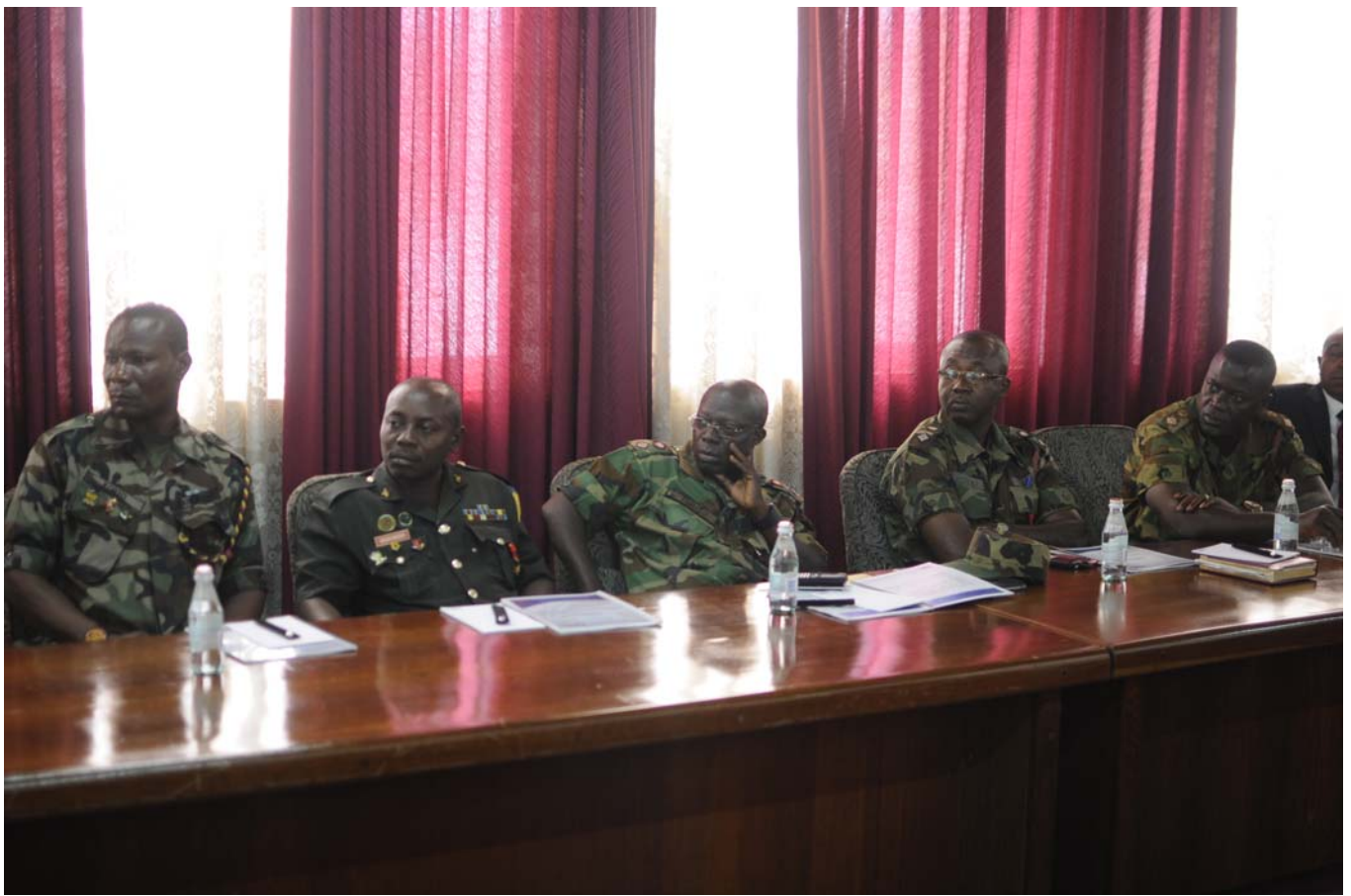
DSC3716 - Minister of Defence Review Committee Session