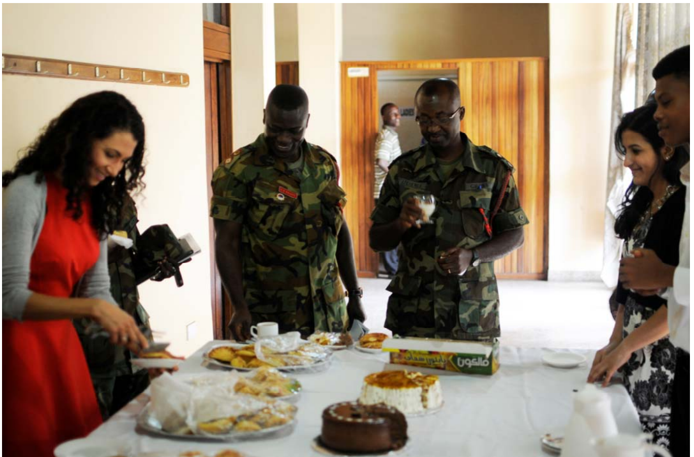
DSC3862 - Kallo hospitality with refreshments for the review committee