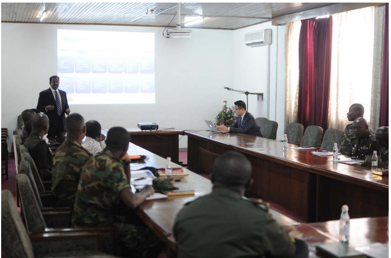
DSC3692 - Mobile Care presentation for the Ministry of Defence Review Committee