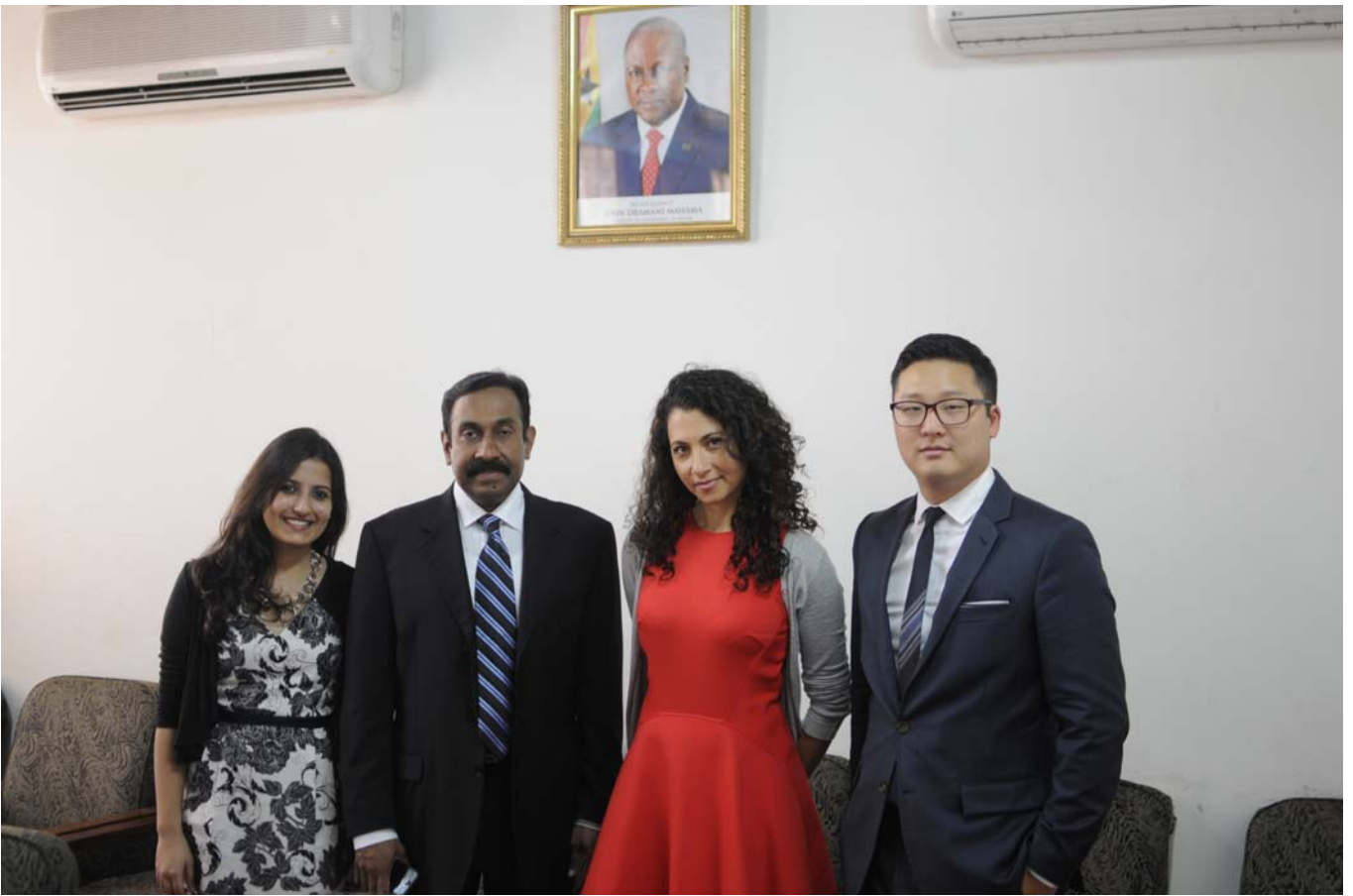
DSC3879 - Kallo (Ghana) Inc. Team