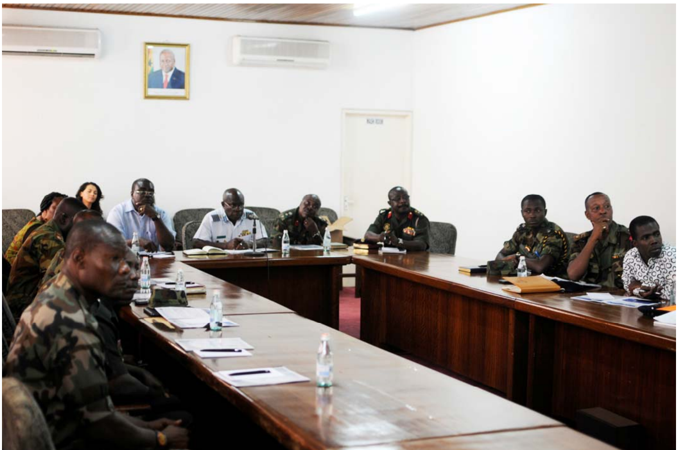
DSC3672 - Ministry of Defence Review Committee